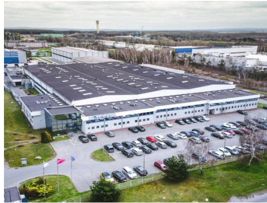
Figure 1 The view of manufacturing plant

FINAL S.A. is a modern company with over 20 years of experience in the production of aluminium profiles, lacquering with the use of the newest trends, and in prefabricating. The company's registered office is located in Katowice Special Economic Zone, in Sosnowiec-Dąbrowa Subzone (Poland). The company is specialised in the production of extruded profiles from the aluminium alloys as well broadly understood processing. The company offer covers various products made of aluminium, which are intended for such industries as construction, machinery, automotive, or industries related to interior design and the introduction of the newest architectonic solutions. Aluminium profiles are manufactured on three modern production lines equipped with the press with a capacity of 2000 tons, 1800 tons, and 1600 tons, respectively.